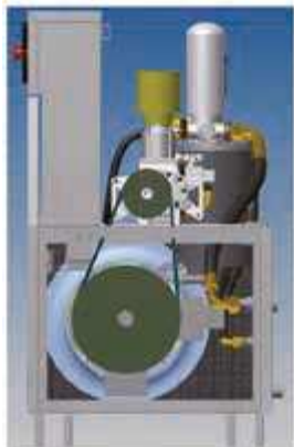
Belt Auto Tensioning system

The automate tensioning of the belt assures long life of the belt, less maintenance and noise reduction.